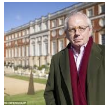
Thurs 26th January David Starkey - History