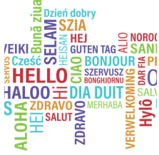
THURS 29th JUNE MFL Extension