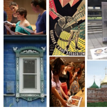
SAT 1st JULY Taste of Russia