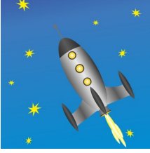
SAT 24th JUNE Space Race