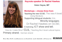
TUES 4th JULY MFL Conference

City Heights Academy at Dulwich College 4 July 2017, 9am - 3.15pm